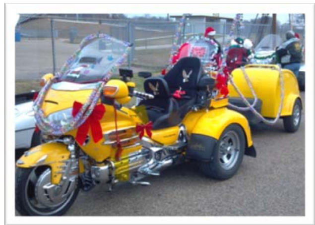
Our trike in a local Christmas parade.