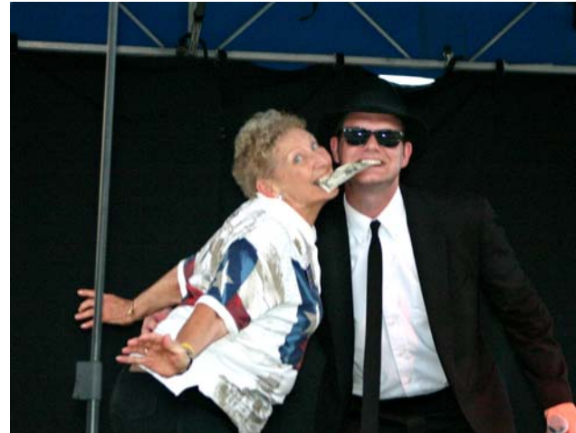
Jean Simmons and "Elwood"