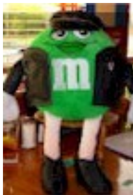
Mascot: Moon Doggie

(Lowe's Parking Lot- I-35S at Alsbury Blvd)